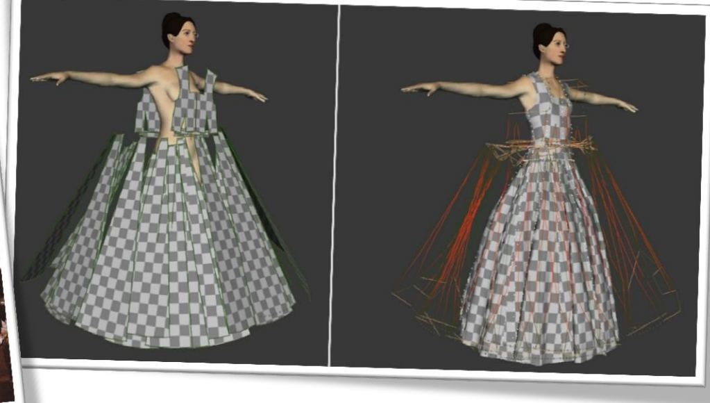
Figure 5: Historical costume exhibition: Louis XVI, robe à la française, 18th century

Figure 6: 2D pattern placement (left) skirt with seams