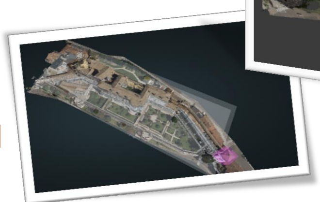
Figure 3: Buonconsiglio Castle 3D online Viewer

FBK – 3DOM The 3DOM research unit of FBK Trento is actively involved in accurate measurements and realitybased 3D reconstruction problems.